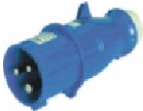
IEC60309 plug (32A 2P+E)